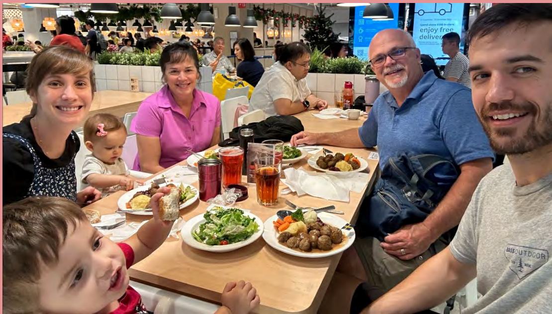
No surgery = Max amount of time for fun

looked through all of the results that the doctor in Indonesia gave and he had something quite different to say. "Your enlarged heart is most likely from all the sports. Your regurgitation is very common and very mild. You do have a slightly shortened PR interval, but I see no indication of an accessory pathway." He put me on a treadmill stress test. "You almost just broke the record. Your arteries are completely fine." He attached a heart monitor for five days to see if he saw anything unusual. The monitor picked up some very minor irregularities but He told me I had nothing to worry about .