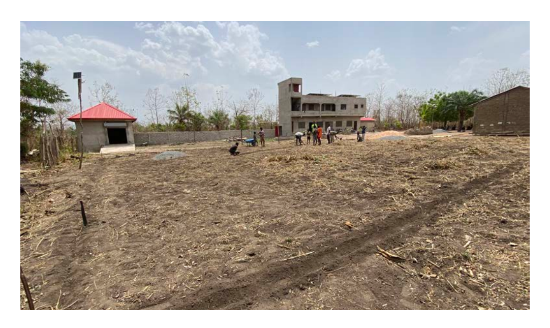
MISAHOME -CHURCH COMPOUND

Our church ministry projects in Misahome are progressing very well. We appreciate your prayers and involvement in these projects.