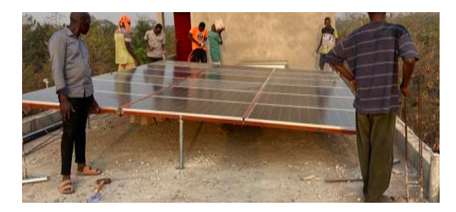
INSTALLATION OF SOLAR PANELS

However, we have more to do regarding our construction projects in Misahome. Two major projects remain untouched: the Pastoral House and the sanctuary building for worship.